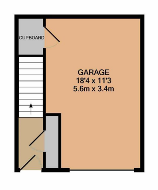
ENTRANCE FLOOR APPROX. FLOOR AREA 257 SQ.FT. (23.9 SQ.M.)