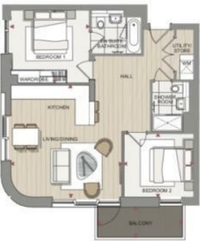
FLAT TYPE 3 2 BEDROOM